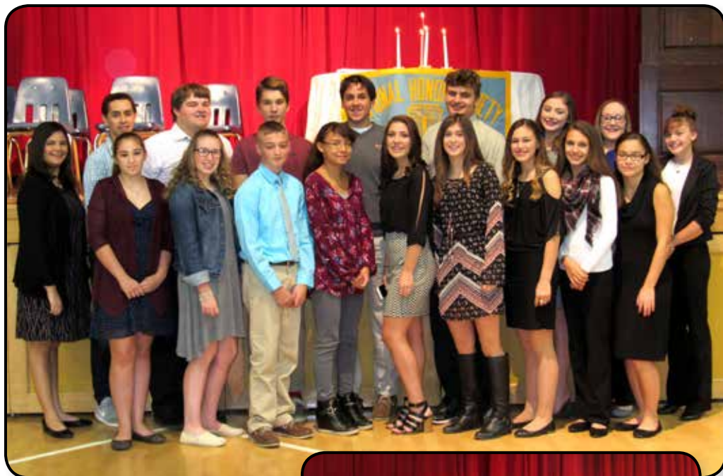
(In the photo above)