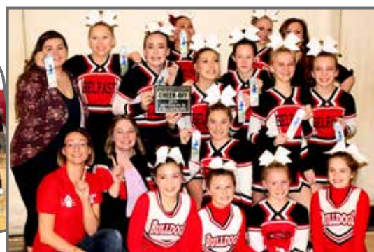
Allegany County Cheer off held at Houghton College. BCS Cheerleaders first division win in 11 years. Congratulations, Bulldogs!!!