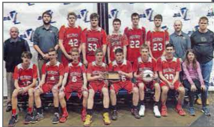
The Bulldogs pose with their Class D2 championship after they defeated top-seeded Prattsburgh for their first championship since 1940 on Saturday at Blue Cross Arena.