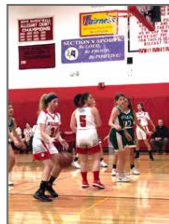
The two above photos were from February 6, 2019 - Girls Varsity vs. Walsh..