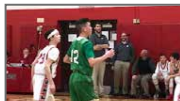
The two above photos were from January 2, 2019 - JV Boys vs. Hinsdale.