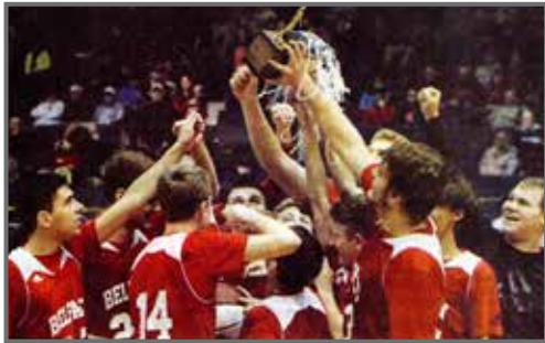
The Belfast boys basketball team celebrates with the Section 5 Class D2 championship trophy on Saturday, March 2, at the Blue Cross Arena in Rochester.

Bulldogs to battle Panama for state final four spot