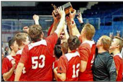
Belfast hoists up its first Section V, Class D2 championship brick since 1940 after the Bulldogs defeated Prattsburgh by a 60-55 count at Blue Cross Arena in Rochester Saturday afternoon.