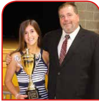
Megan Rose Paul Vienna Scholarship