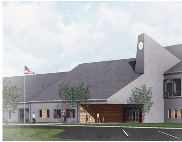
STATE STREET ELEMENTARY TSKP STUDIO + NORTHEAST COLLABORATIVE