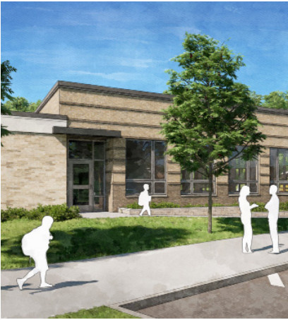
DUNN'S CORNERS ELEMENTARY DBVW ARCHITECTS