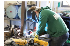
BOCES TECH CENTER