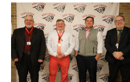
CHAIN OF CONTACT