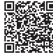
COMMUNITY ELIGIBILITY PROGRAM