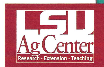
Above: Sample Artwork of RIGHT sleeve image

Below: Sample Artwork of BACK shirt image; says "HEAD, HEART, HANDS, HEALTH" in a matrix with images of each to represent the four H's in 4-H Pledge