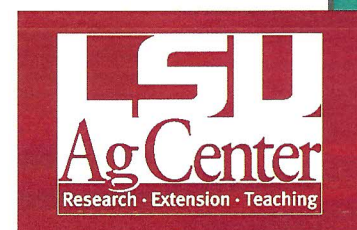
Above: Sample Artwork of RIGHT sleeve image

Below: Sample Artwork of BACK shirt image; says "HEAD, HEART, HANDS, HEALTH" in a matrix with images of each to represent the four H's in 4-H Pledge