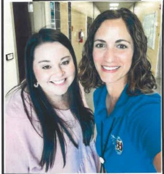
MPE Counseling Crew