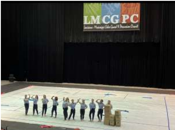
Congrats to the HHS Colorguard for bringing home 1st place in the LMCGPC Championship of Scholastic Regional A River Division!!!