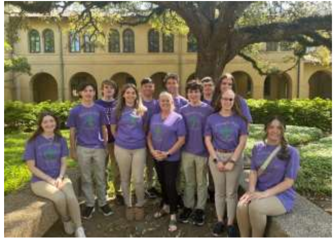
Congrats to our HHS Literary Rally Team! Results are posted on our HHS social media accounts!