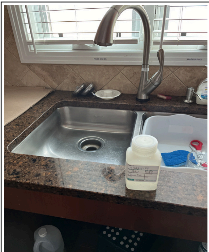
7/12/2024 - 10508-1 - Transition House - Kitchen Sink