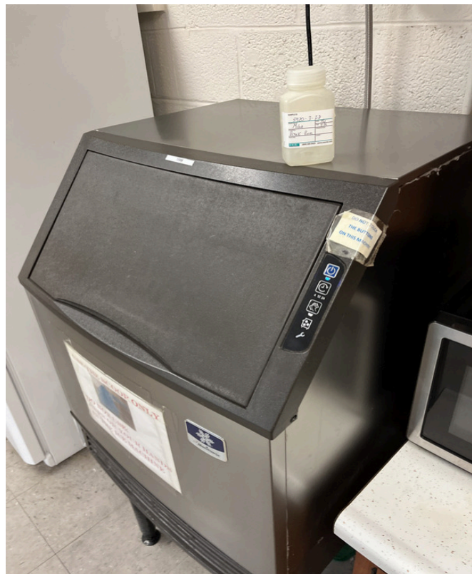
7/12/2024 - 5920-3 - Transportation - Breakroom