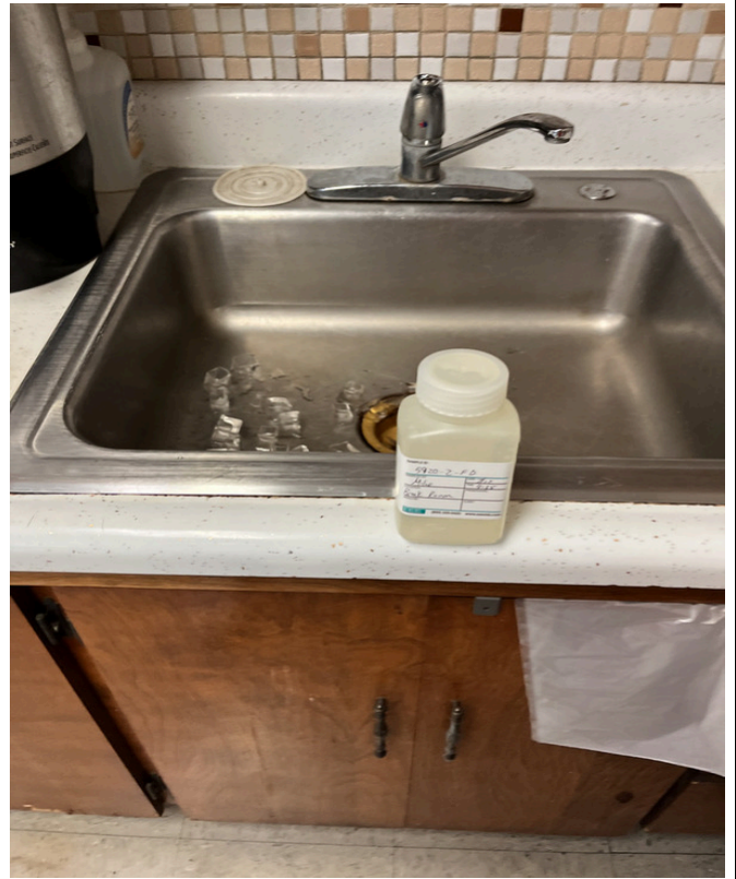
7/12/2024 - 5920-2 - Transportation - Breakroom