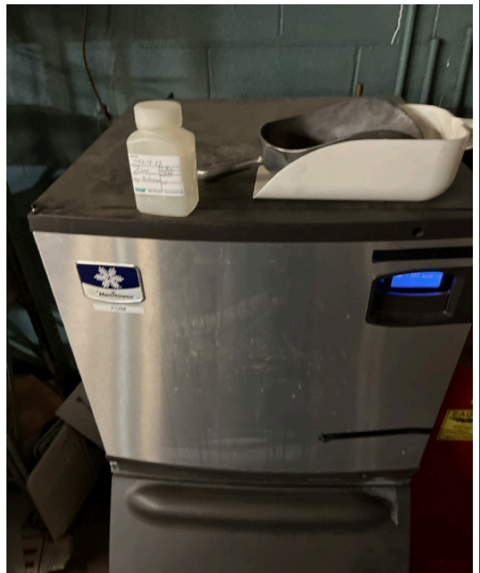
7/12/2024 - 5911-4 - Facility Operations - Near Restrooms