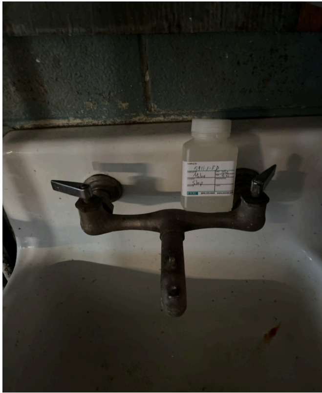
7/12/2024 - 5911-1 - Facility Operations - Shop