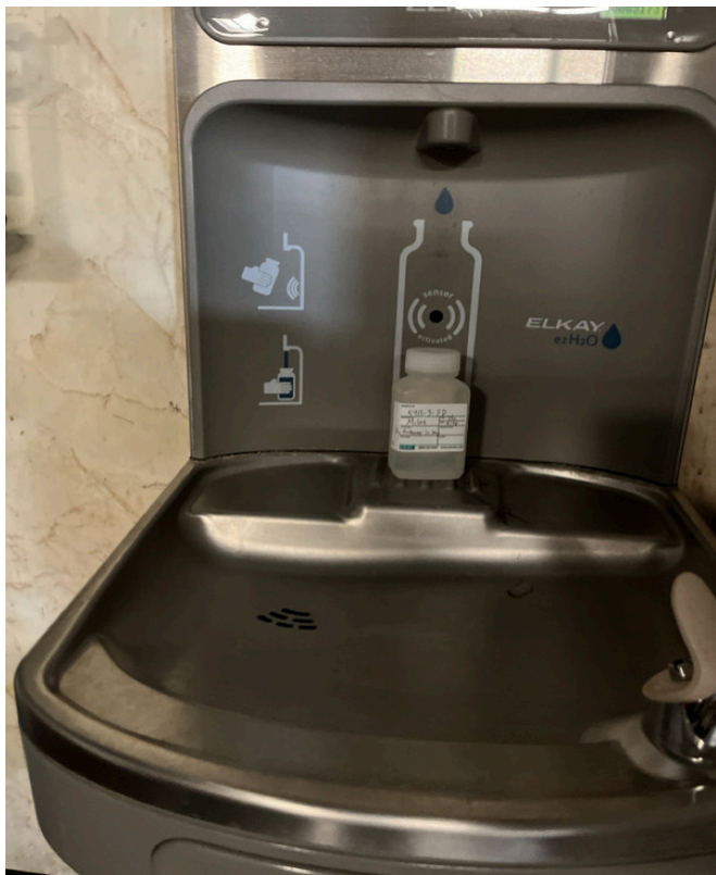
7/12/2024 - 5911-3 - Facility Operations - Shop by Restrooms