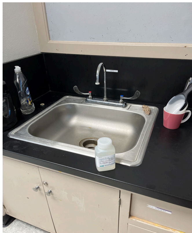
7/8/2024 - 4400-7 - Northwood School - Old Apt Sink - Room 101