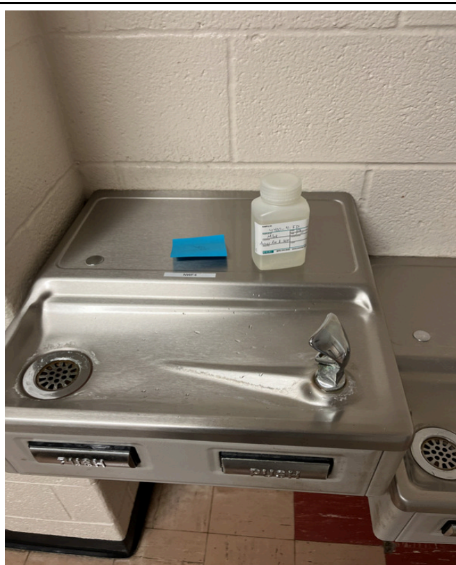
7/8/2024 - 4400-4 - Northwood School - Across from Room 1 - Left