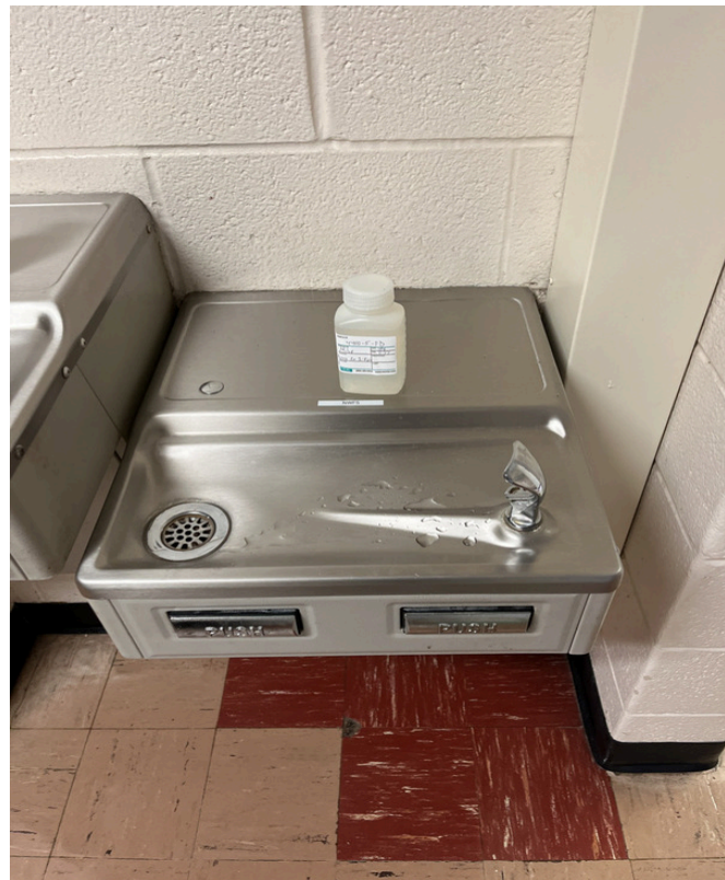
7/8/2024 - 4400-5 - Northwood School - Across from Room 1 - Right