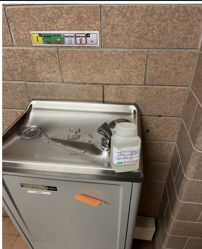
7/8/2024 - 4400-2 - Northwood School - Outside Office