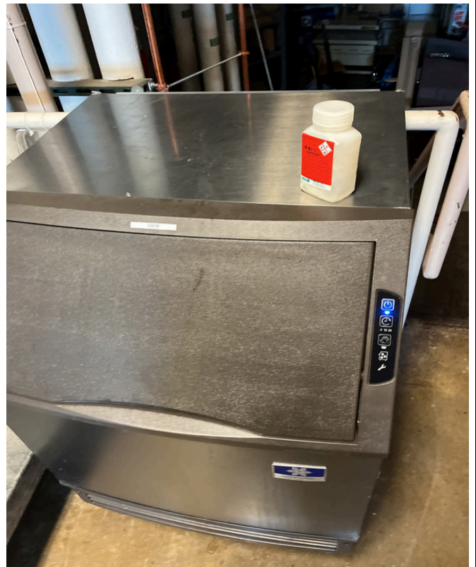
7/8/2024 - 4400-10 - Northwood School - Boiler Room