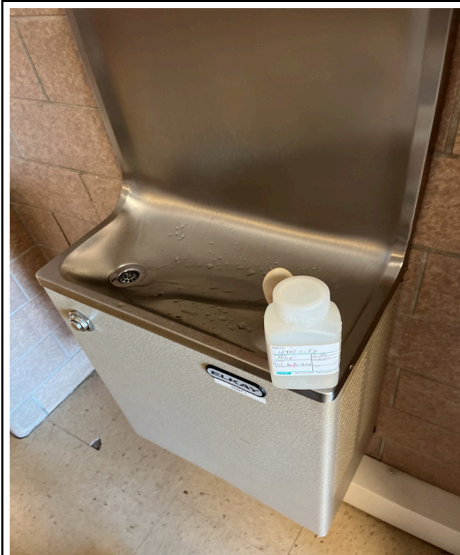
7/8/2024 - 4400-1 - Northwood School - Next To Room 104A