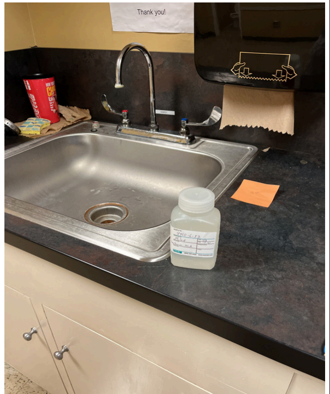
7/8/2024 - 4400-6 - Northwood School - Workroom 101A