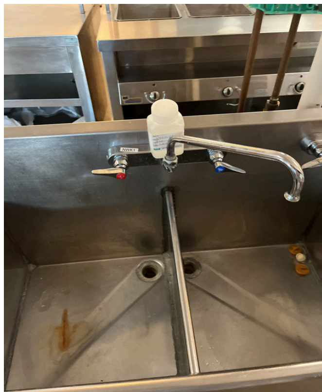
7/8/2024 - 4400-11 - Northwood School - Triple Sink - Left