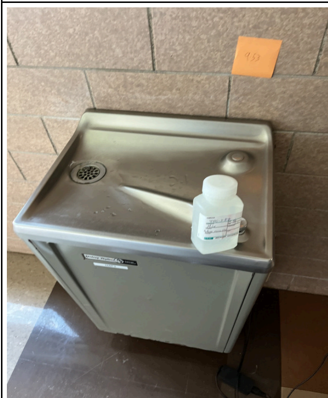
7/8/2024 - 4400-3 - Northwood School - Hallway Across from Room 114