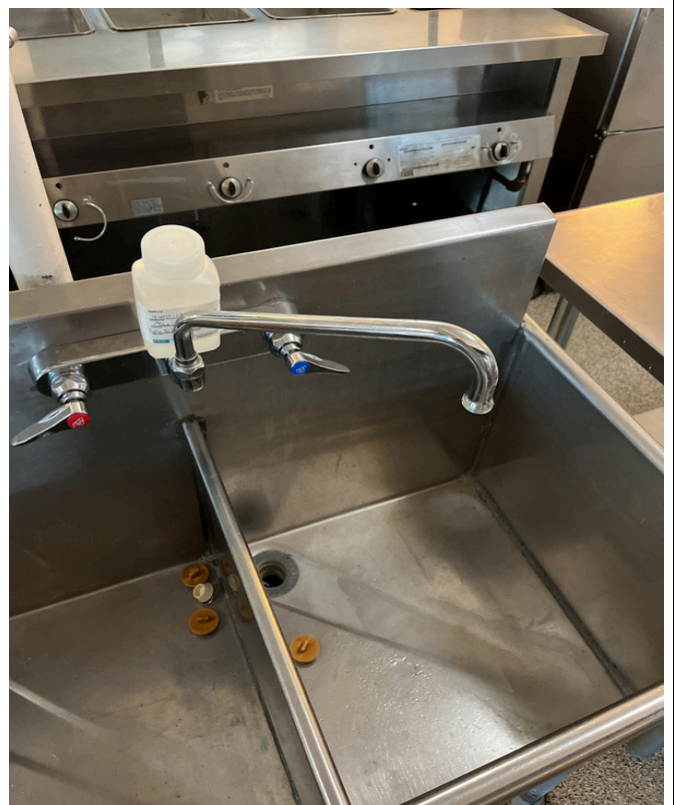
7/8/2024 - 4400-12 - Northwood School - Triple Sink - Right