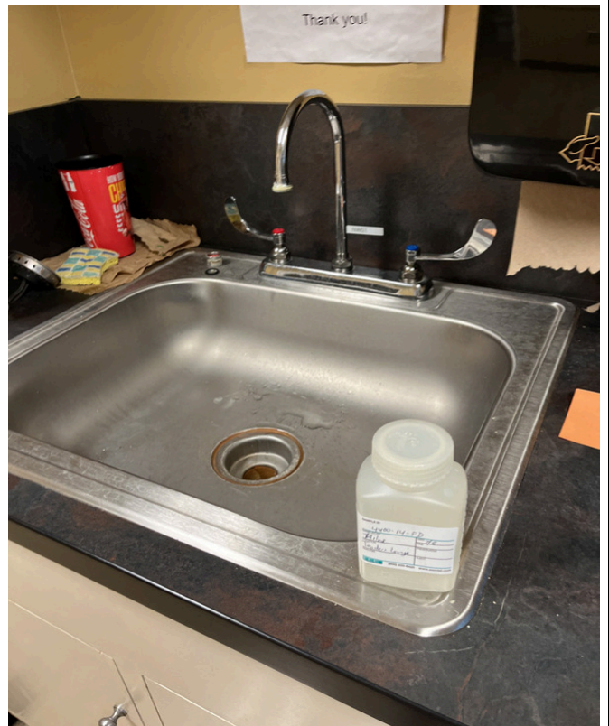
7/8/2024 - 4400-14 - Northwood School - Teacher's Lounge