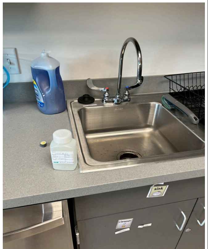
7/8/2024 - 4400-8 - Northwood School - Room 1 - Right