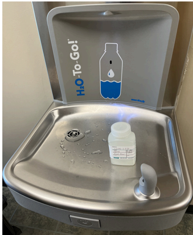
7/10/2024 - 6608-1 - Administration Building - First Floor