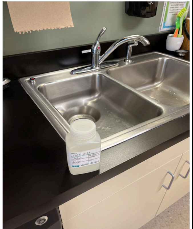
7/10/2024 - 6608-2 - Administration Building - Lounge