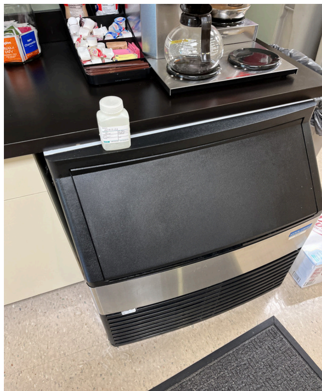
7/10/2024 - 6608-3 - Administration Building - First Floor