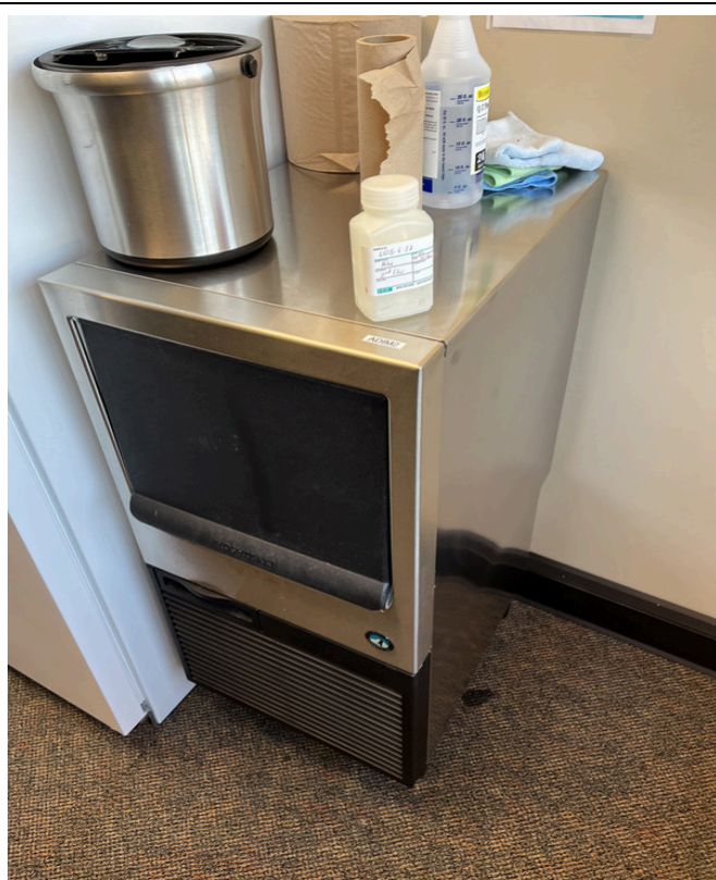
7/10/2024 - 6608-6 - Administration Building - Second Floor Lounge