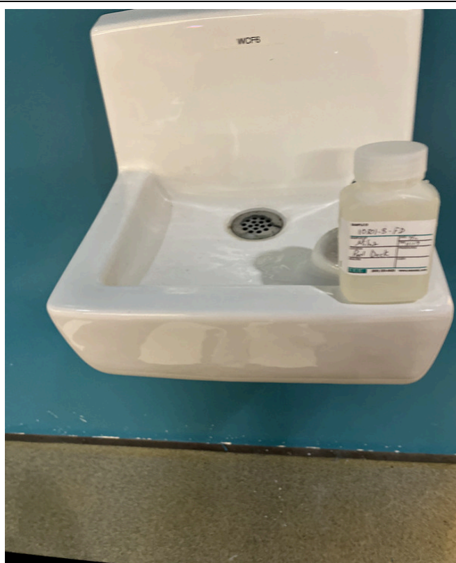
7/11/2024 - 10301-8 - Wellness Center - Pool Deck