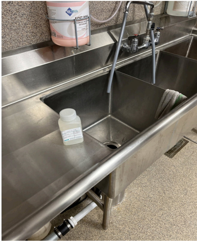
7/11/2024 - 10301-1 - Wellness Center - Triple Sink - Left