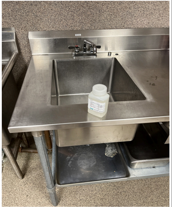
7/11/2024 - 10301-2 - Wellness Center - Prep Sink