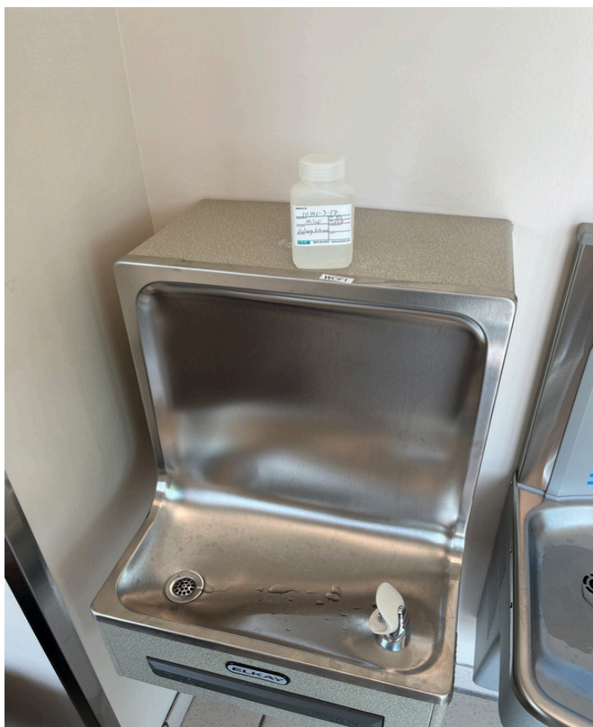
7/11/2024 - 10301-3 - Wellness Center - Hallway Entrance