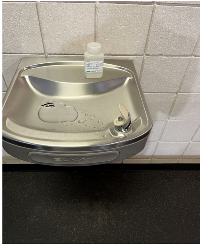
7/11/2024 - 10301-9 - Wellness Center - Upstairs - Left