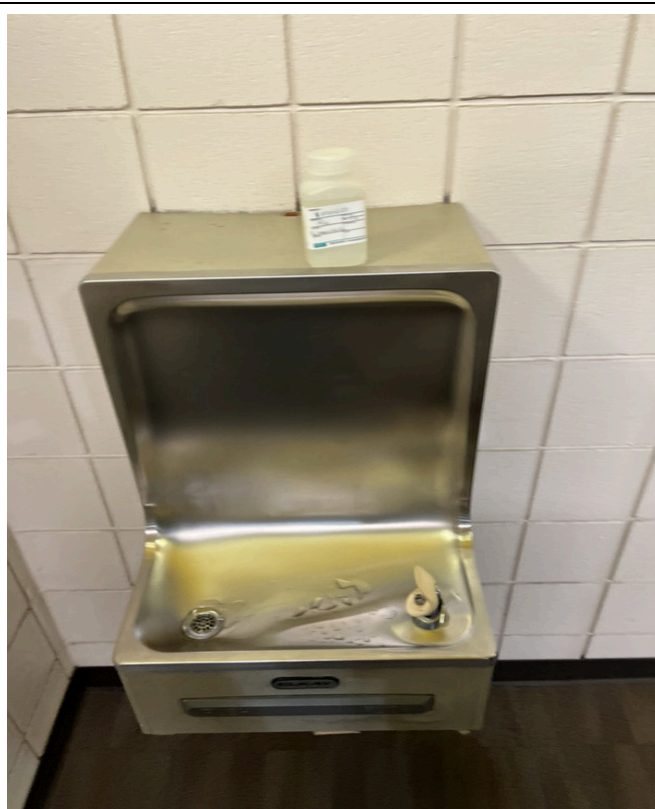
7/11/2024 - 10301-6 - Wellness Center - Women's Locker Room Entrance