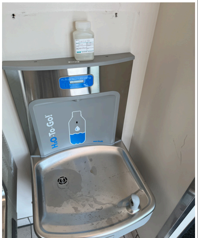
7/11/2024 - 10301-4 - Wellness Center - Hallway Entrance - Right