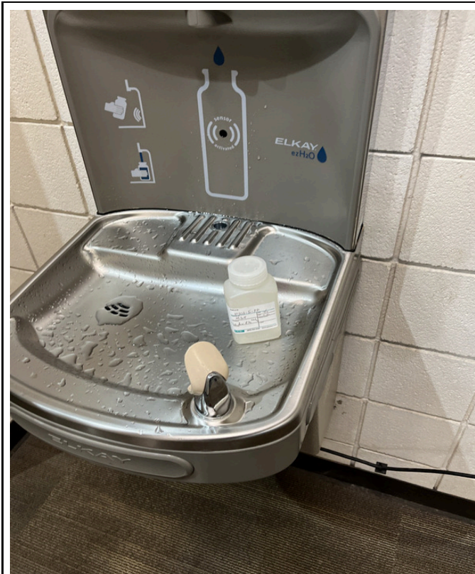
7/11/2024 - 10301-5 - Wellness Center - By Club E Door - Treadmill Side