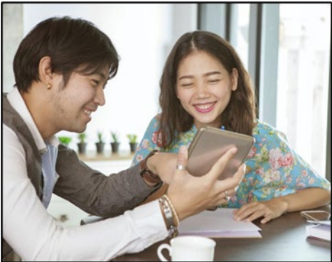
Become a tutor.