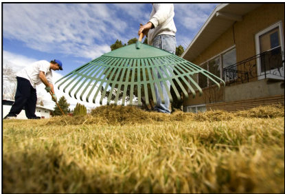
Help with city or school beautification projects.