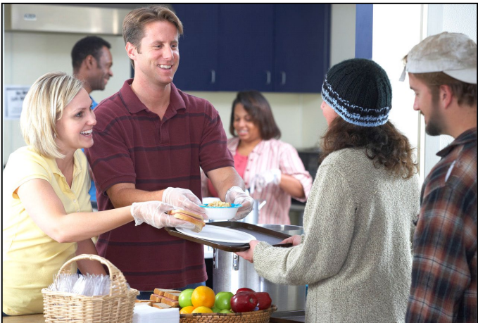
Serve or prepare meals at homeless shelters.