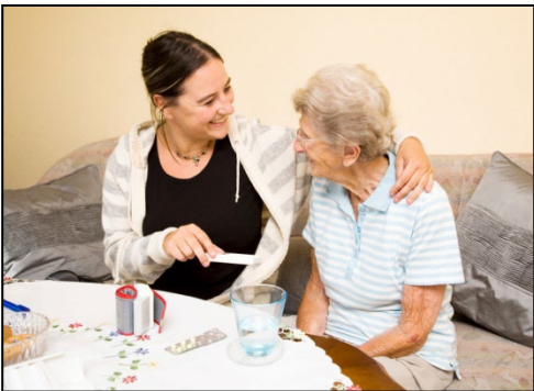
Assist the elderly at senior citizen centers.