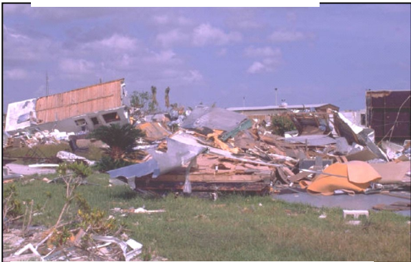
Help communities with storm clean-up.