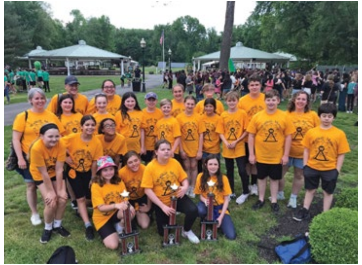
Ostrander, Leptondale, and Plattekill Elementary School students combined forces in late May and did an amazing job performing at the 2024 Great Adventure Music Competition. The orchestra, chorus, and the band competed and our Panthers brought home three first place trophies. A huge thank you goes out to our awesome music teachers, all the parents, chaperones, bus drivers, volunteers, judges, and student performers!

Grade 12: booster required. (Only one dose is needed if student received first dose after age 16.)