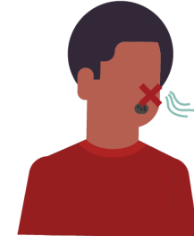
LOSS OF TASTE OR SMELL