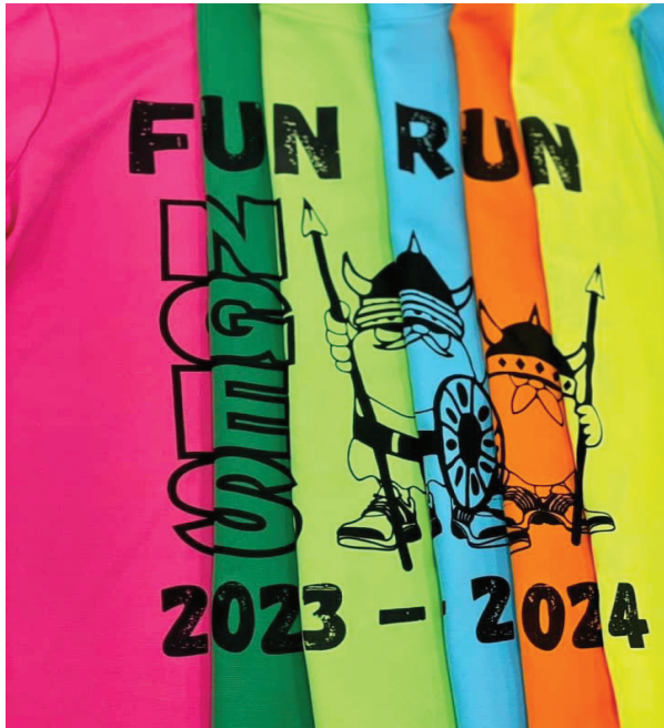
Our 2023-2024 Sponsors! With the help of these local businesses, NGES PTO was able to provide every student in the school with a new t-shirt. That's over 700 kids promoting your business!