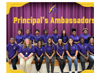
23-24 & Our Vision in 24-25