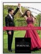
Full Page Layouts

Choose your ad size and layout (Options may vary by school.)