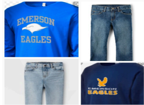
Friday Spirit Day Options