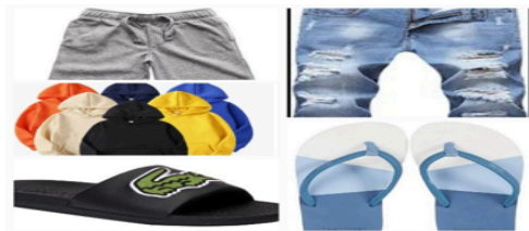
Do Not Wear to School

Emerson is not a free dress school! If you need assistance with uniforms please contact the office.