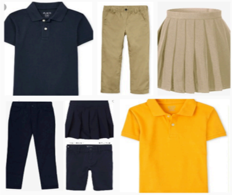
Monday-Thursday Uniform Options