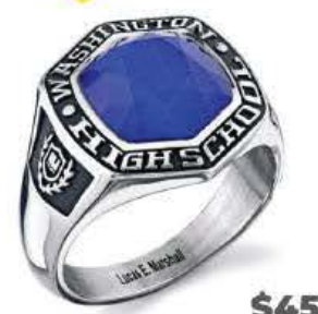
Davis Traditional Large KS100(L).