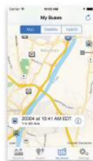
ACTUAL APP VIEW: "My Buses" screen

View all your children's buses simultaneously