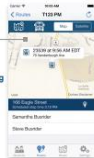
ACTUAL APP VIEW: "Routes" screen

View multiple stops along the route, including the scheduled arrival times for each stop