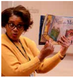
Circle & Gym Time - Outdoor Classroom