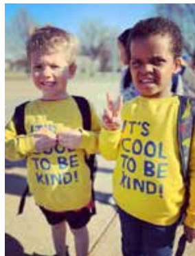
Building Routines Social Skills Listening Learning