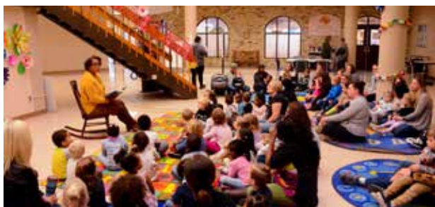
Independence - Cooperation - Relationships - Play