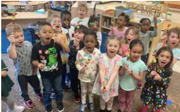
Art & Crafts Science & Math Sensory Play Stories