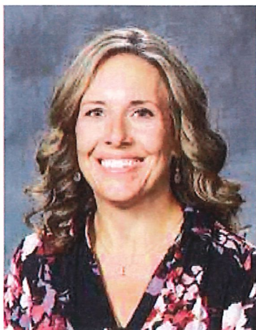
Special Education Director Okanogan School District

I am proud of our staff, students, and community as Okanogan is an amazing place to be. Thank you for your continued support and partnership.