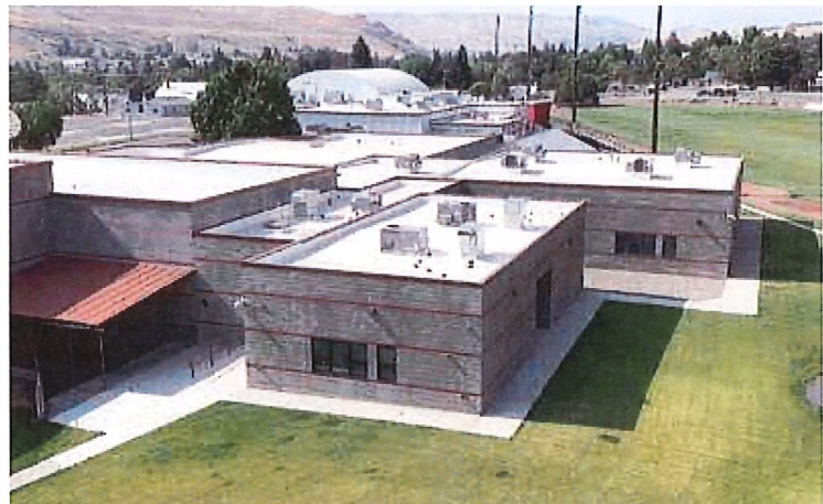
New addition to Okanogan High School includes two new classrooms.

Our new greenhouse is an 1800 sq ft structure, complete with automated temperature and humidity monitoring and controls. This fall, we are adding an automated shade cloth system, and drip irrigation for the hanging baskets, thanks to a grant from the Washington FFA Foundation. Our first year utilizing this learning lab was a huge success and the agriculture department is looking forward to implementing this facility in class again this school year!