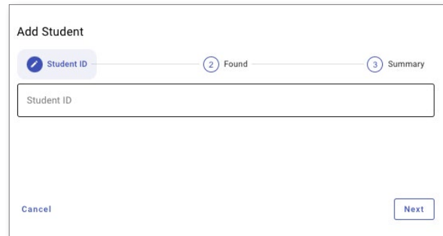
Find Your Student