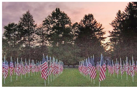
American flags on display at the FDR Home during the annual Field of Honor event.