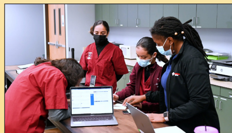
Natomas High School CTE Health Pathway Students will work in the new clinic facilities.