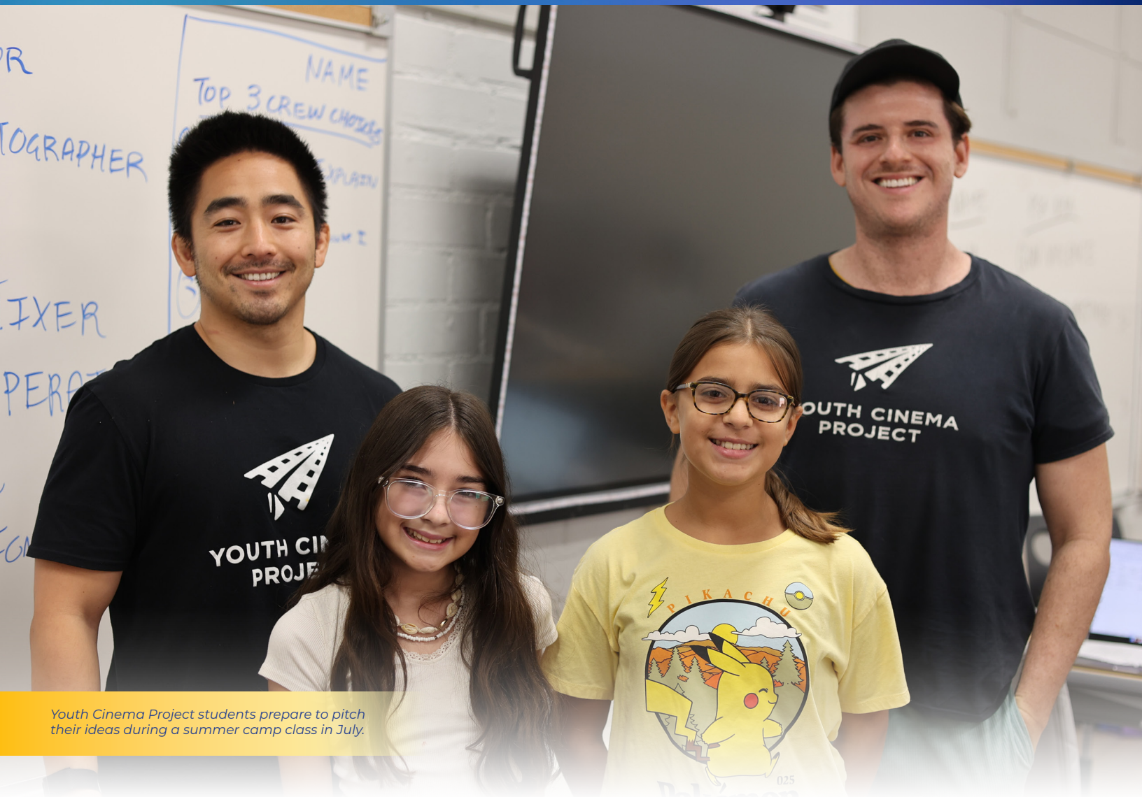
Youth Cinema Project students prepare to pitch their ideas during a summer camp class in July.