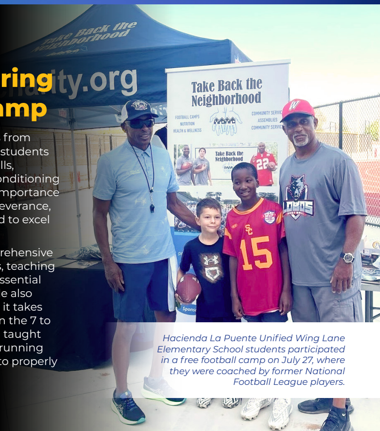
Hacienda La Puente Unified Wing Lane Elementary School students participated in a free football camp on July 27, where they were coached by former National Football League players.