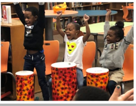
GSE: ELAGSEKRF2, ELAGSE1RF2, ELAGSE1RF3, TAK.RE.1