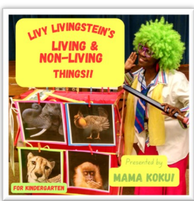
GSE: SKL1; SKL2; ELAGSEKSL2