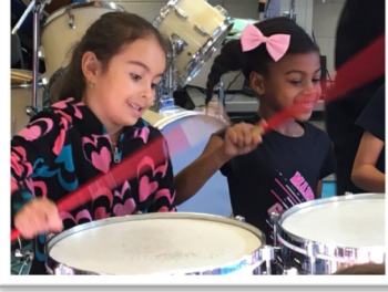
GSE: MGSEK.G.2,3; ESGMK.CR.1; ESGMK.PR.2, ESGMK.RE.1; ESGMK.CN.1-2, TAK.RE.1

Assembly-style, 50 min., 9:30 am & 10:30 am