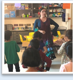
GSE: ELAGSEKW8; ELAGSEKSL4; ESDK.CR.2; ESDK.PR.1, 2; ESDK.CN.1; ML1.PSS.CU1

Assembly-style, 50 min. 9:30 am or 10:30 am