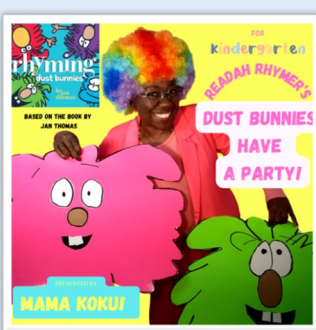
GSE: ELAGSEKRF2, ELAGSEKRF3, TAK.RE.1

Workshop-style (*see set up needs), 45 min.; 60 students per session, multiple sessions can be booked back-to-back, inquire for available dates & times.