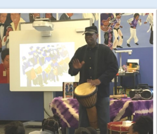
GSE: ELAGSEKRL10, SSKH1.d, SSKH3, TAK.RE.1; ESGMK.PR.2a,b; ESGMK.RE.1a,b,c; ESGMK.CN.2a,b,c

Assembly-style, 50 min performance + 50 min activity 9:30 & 10:30