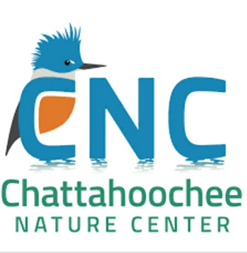
GSE: SKL2; ELAGSEKSL3

Assembly-style, 50 min., 9:30 am & 10:30 am