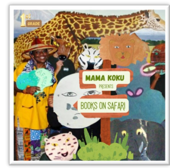
GSE: ELAGSE1RL1,2,3; ELAGS- E1SL1,2,3; ELACC1RL2, 3; TA1.RE.1

* Live @ Your School Set Up Needs: Please plan to host performance in a large, cleared, quiet area such as your media center. Students can be seated on the floor or in chairs. They will need room to move around.