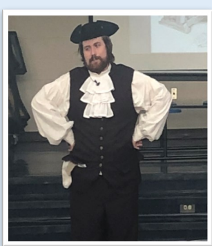
GSE: SS1H1a; SS1G1a; TA1.RE.1

Assembly-style. 50 min, 9:30, 10:30, & 11:30;