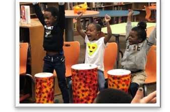
GSE: ELAGSEKRF2, ELAGSE1RF2, ELAGSE1RF3, TAK.RE.1

* Live @ Your School Set Up Needs: Please plan to host performance in a large, cleared, quiet area such as your media center. Students can be seated on the floor or in chairs.