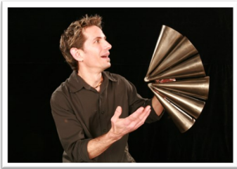
GSE: S1P1.c,d; ESGM1.RE.1b,c; ESGM1.CN.1b; ESGM1.CN.2a,c