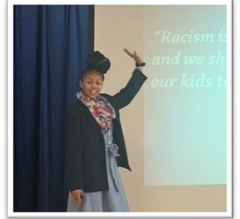
GSE: SS1H1a,b; SS1G1d; SS1CG1; ELAGSE1SL4; TA1.RE.1

Available Feb-April, inquire about available dates and times.