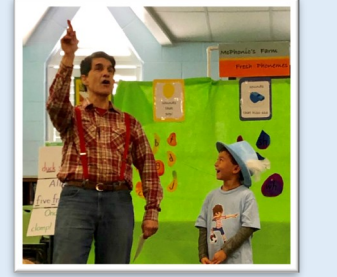
GSE: ELAGSE1RF2a, ELAGSE1RF2b, ELAGSE1RF2c, ELAGSE1RF2d, TA1.RE.1

* Live @ Your School Set Up Needs: Please plan to host performance in a large, cleared, quiet area such as your media center. Performer will need access to laptop, projector and screen. Students can be seated on the floor or in chairs.