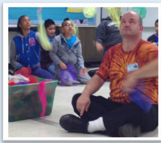
FIG Newton: the Physical Science of Juggling

Assembly-style, 50 minutes, 65 students min/200 students max per performance, multiple performances can be booked to serve all students. Inquire for available dates and times.