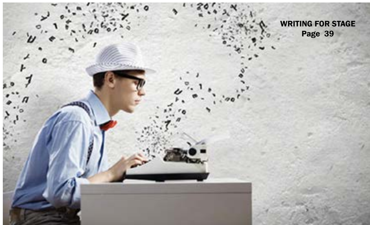
WRITING FOR STAGE Page 39

Please see school policies on page 4. ALC classes are only for students 18 years and older.