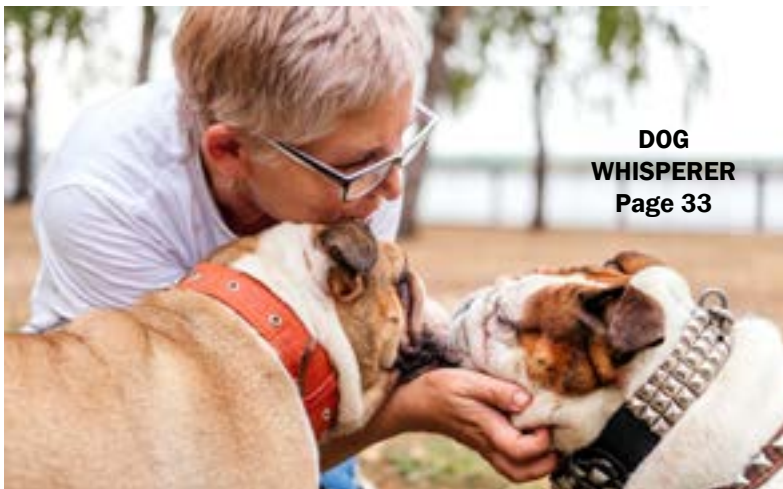
DOG WHISPERER Page 33

Virginia Beach City Public Schools and the Adult Learning Center assume no liability for products, services, or statements made by the advertisers, nor can we be held liable for typographical errors, misprints, or misinformation contained herein. No part of this publication may be reproduced or shared in any form without giving specific credit to the Virginia Beach City Public Schools. Created by Adult Learning Center staff.