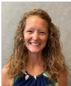
Brenda Rockwell Kindergarten