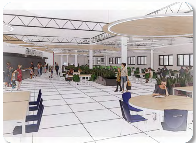
New cafeteria areas