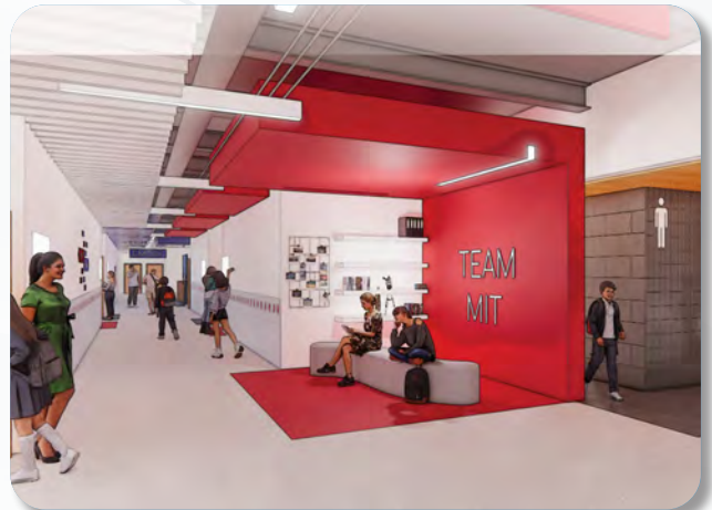
Common learning areas for teams

The Media Center, along with the beautiful Fine Arts facility on the building's west side, will continue to be a shared space utilized by both grades.