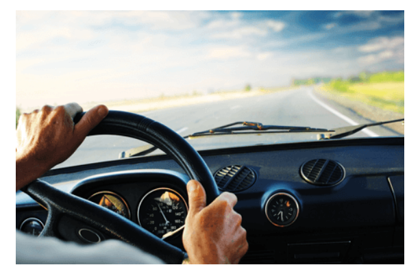
Sessions take place at CHHS in room 105

Parents/guardians will be required to complete Safeway's Account Verification. Safeway will send out an email before class begins that gives detailed information about how to login to the student's Safeway account to verify and complete contact information and to review and acknowledge our Service Agreement.