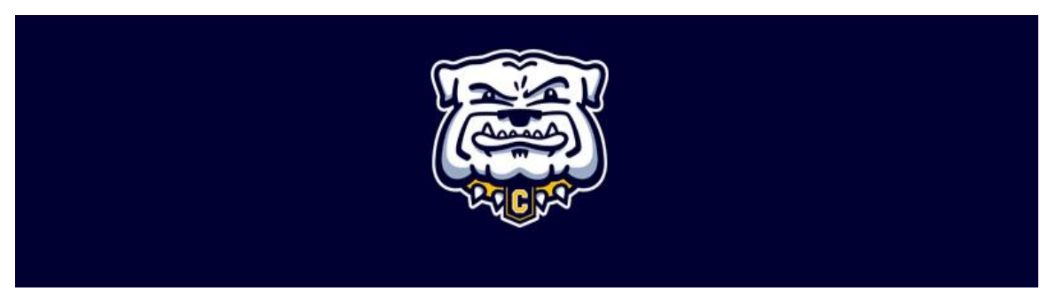
Chelsea High School Code: 230-610