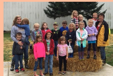
A f g " ` 7 i f h ] g

Throughout the month of October, preschool students will participate in a variety of fun apple activities: dissecting an apple, studying the life cycle of an apple, making and eating apple crisp, and counting apple seeds.