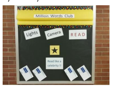
Thank you for joining us at Reading Under the Lights!