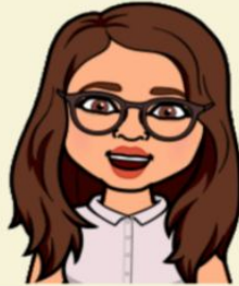
College Counselor (Last names A-L)