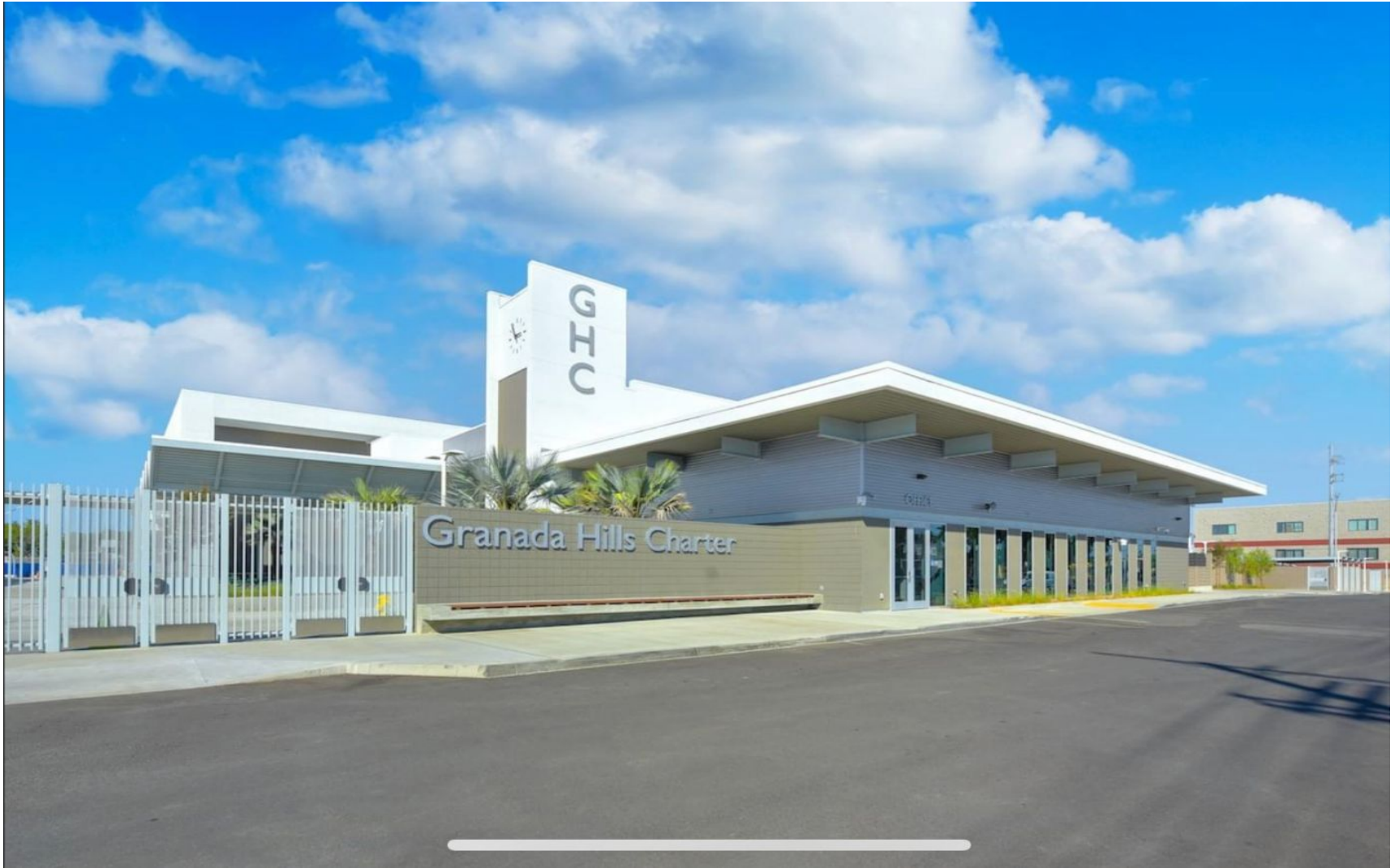
GRANADA HILLS CHARTER TK-8 PROGRAM