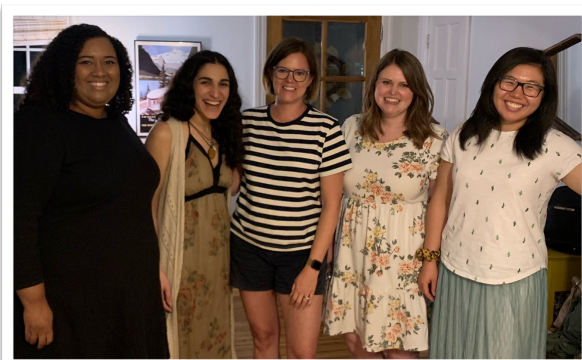
The class of 2021 faced the some of the biggest challenges yet, and came out smiling.