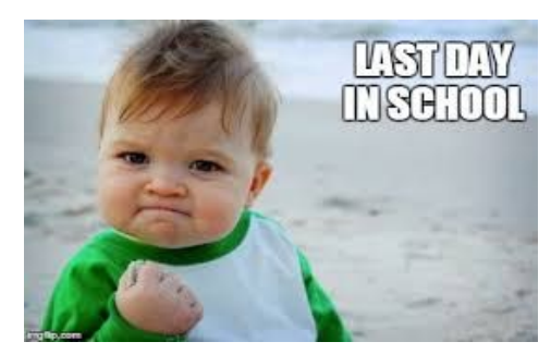
The last day of school is Thursday, June 20th.

Summer sports physicals for the 2019-2020 school year will be held on June 27, 2019, at Sussex Middle School. Physicals will take place from 9 a.m. until 11 a.m. and are for Sussex Middle School students only.