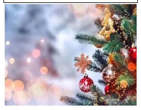
Wishing everyone a happy and healthy holiday season!