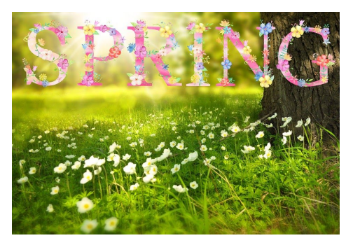
Countdown to Spring! Only 58 days to go!

For more information go to https://www.swpto.org/fundraising