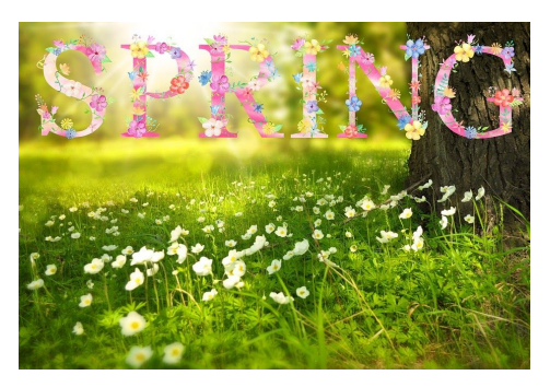
Countdown to Spring! Only 37 days to go!

For more information go to https://www.swpto.org/fundraising