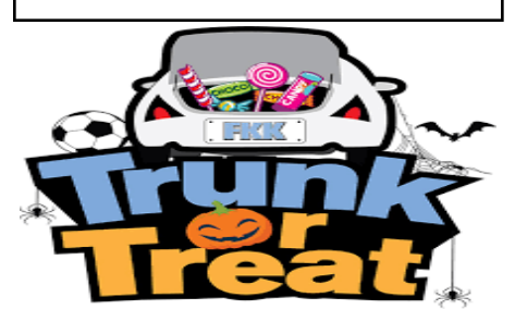
On Friday, October 28th the C. E. Lawrence School will be hosting a Trunk or Treat from 5 p.m. until 6:30 p.m. More information can be found at the following site:

https://www.eventbrite.com/e/sussex-wan tage-pto-trunk-or-treat-2022-tickets-4160 29233637