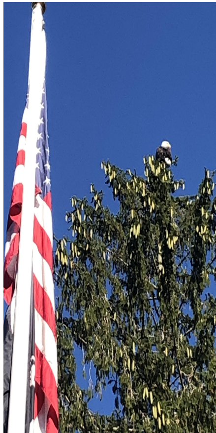
A Bald Eagle visited WES and landed in the front of the school during bus drop off on the first day of school.