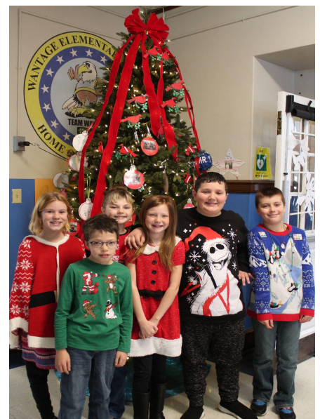
Holiday Spirit Week